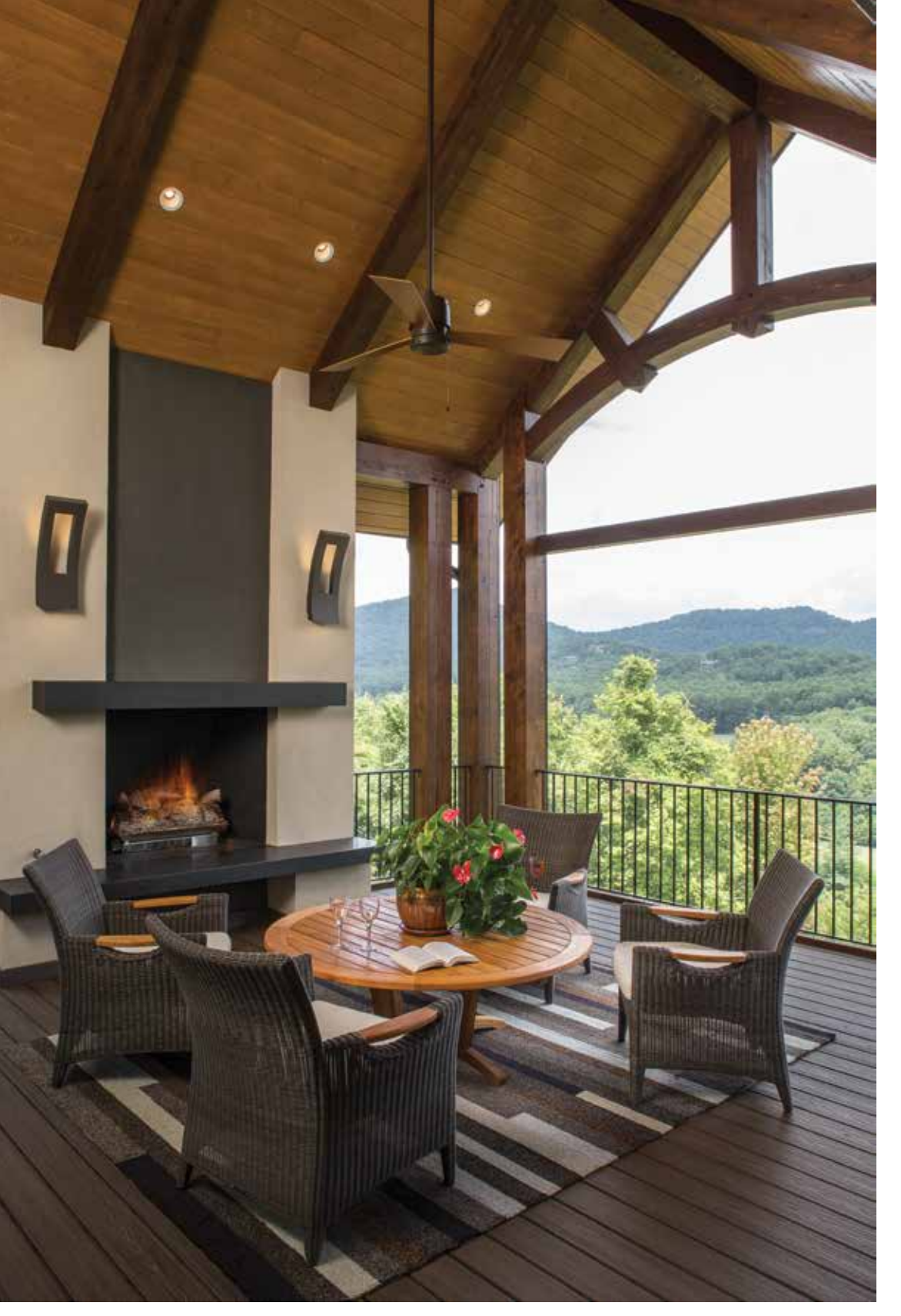
A porch on the main level draws guests to the natural beauty of the North Carolina mountains. Stucco and granite set this fireplace apart from the interior hearth, formed of polished, engineered concrete. The curved light sconces were found by the owners while on vacation.