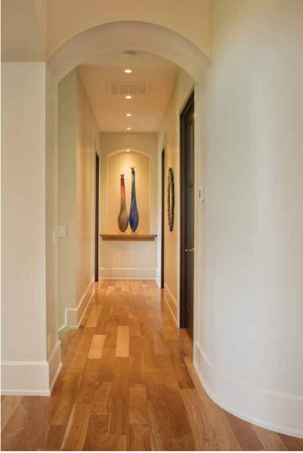
Curves repeated throughout the home challenged all the trades during construction. The builder, Thompson Properties, fashioned a base trim from flexible resin to run seamlessly along the curve of this wall.