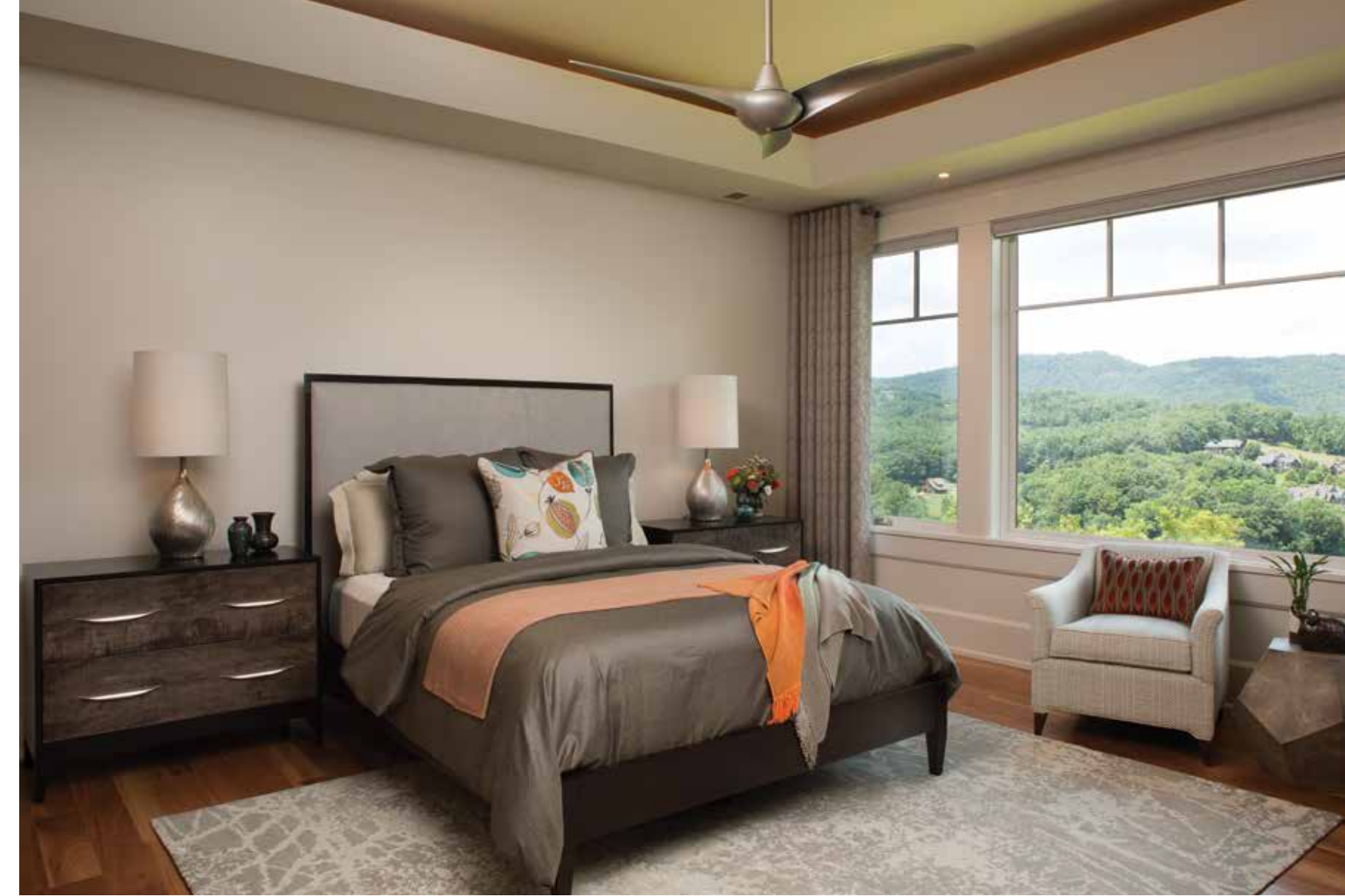
The master bedroom brings together all the conceptual tastes of the clients: warm colors, high contrast, and curves. Silk duvet cover from Porter & Prince. Silken wool rug from Tufenkian Artisan Carpets. Handmade bamboo throws by fiber artist Barb Butler.